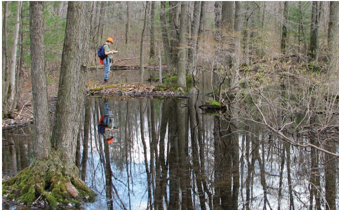
B. LEPPPO/ PNHP