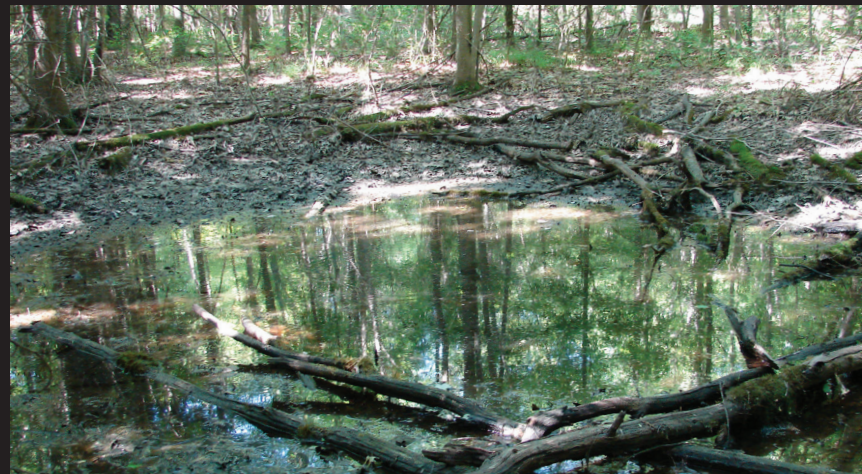
Two vernal pools in their dry ( left ) and wet ( right ) phases